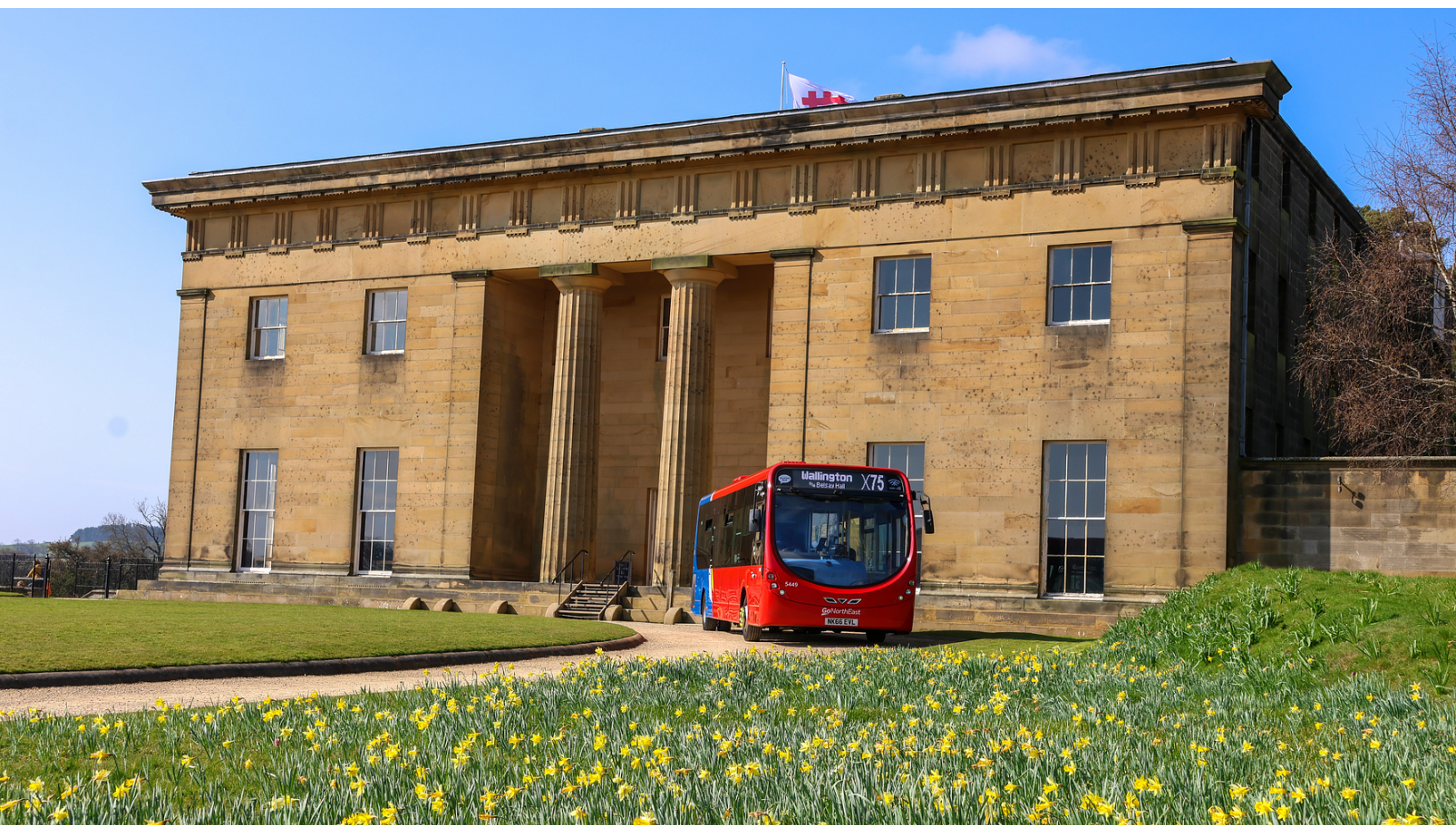
X75 pictured outside Belsay Hall.